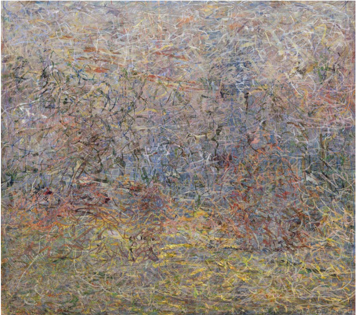
Captions: Page 1: Stanley Casselman, IR #16, acrylic on canvas, 165x165cm, 2012; above, Hyo Myoung Kim, Monet 295 , 2013 Lambda print