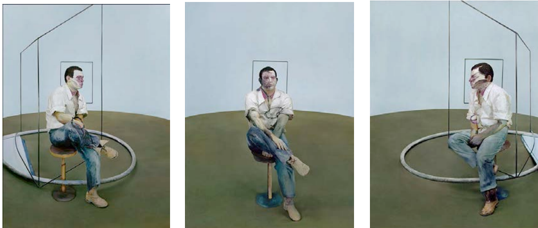
Michel Platnic, After Three Studies for a Portrait of John Edwards , 2013, 3 HD digital videos, 200x150cm

The Window Project provides artists with a complete creative control of the gallery's frontage for a period of time either between the exhibitions (therefore independently run from the program) or as an extension of the gallery-held shows.