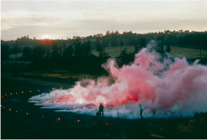
© Judy Chicago, Pink Atmosphere , Cal State Fullerton, Fullerton, CA, 1971/2018