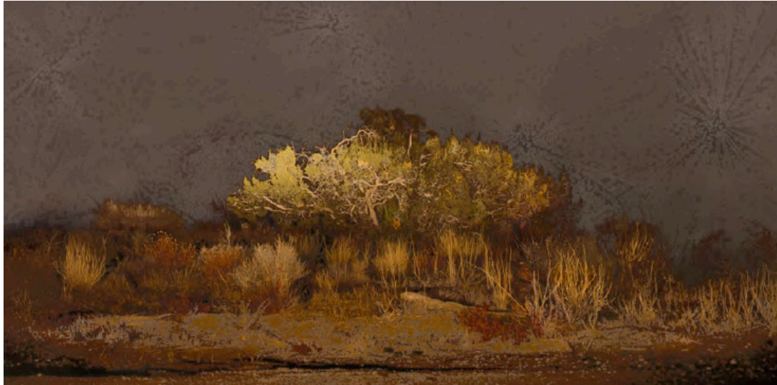
Scenapse #8 (Desert Nocturn) © Aziz + Cucher

Seen together, these two bodies of work evoke feelings of fragility and transience, qualities that are part of both the natural and man-made world.